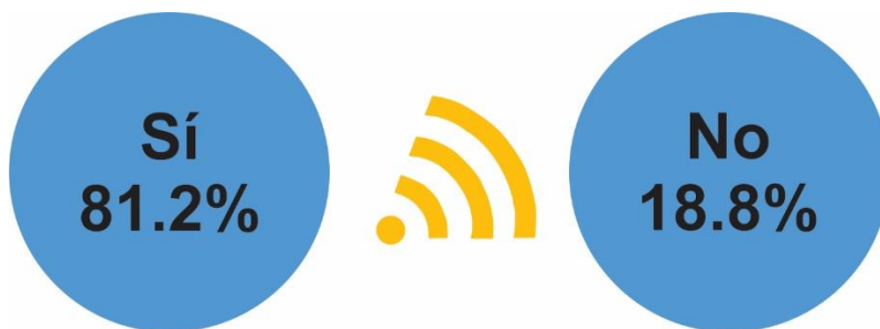
Figura 2. ¿Tiene conexión de internet en su casa? (población de 15 años o más del estado de Jalisco)