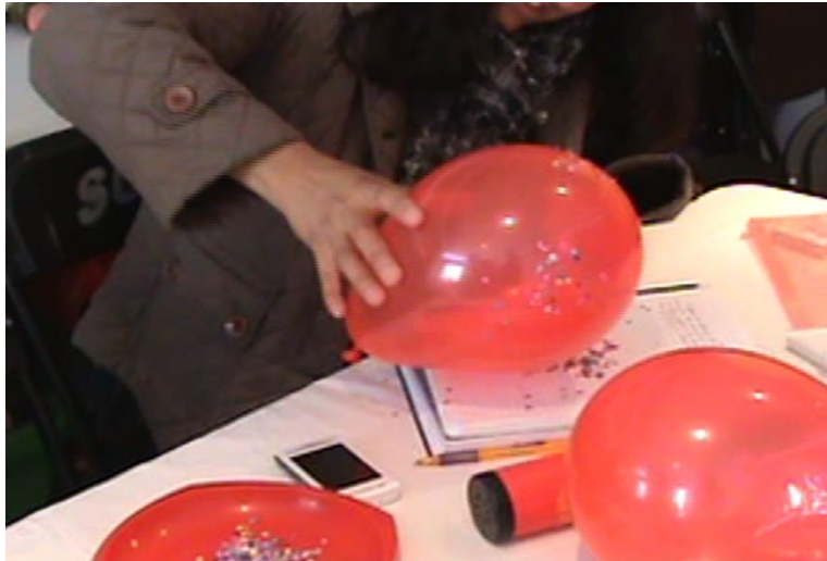
Figura 2. Experimentos con globos y papel para observar fenómenos eléctricos