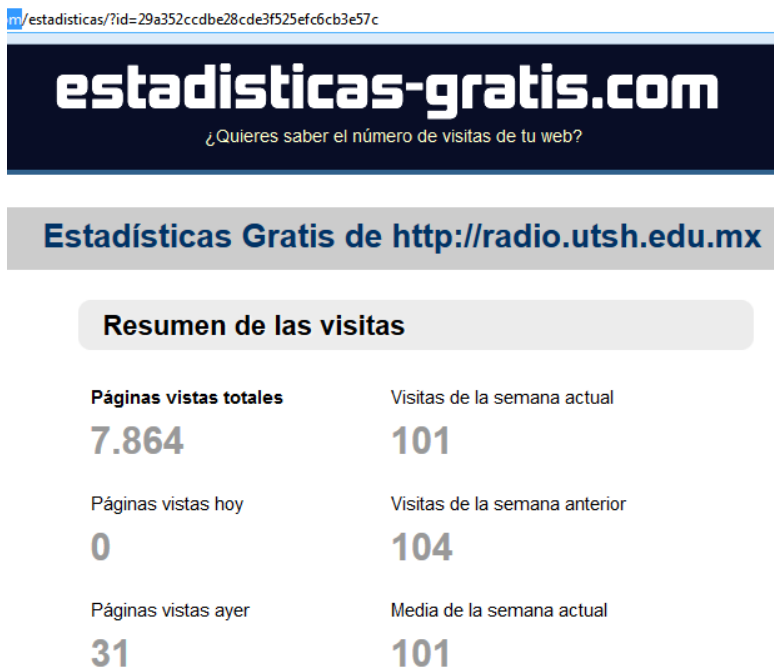
FIGURE 2. Image statistics page for the domain of radio.