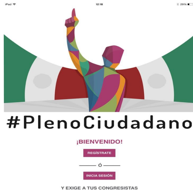
Figure 1. Cover Full Citizen

PlenoCiudadano is a technology platform that was launched on Monday, September 7, 2015. It is an application designed for users of Android and Apple devices which can be downloaded for free from Google Play and App Store, respectively (Figure 1).