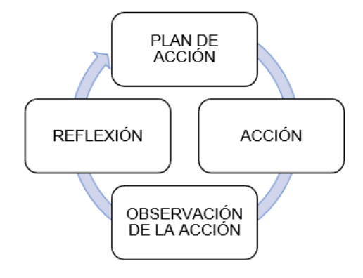
Figure 1. Phases of action research