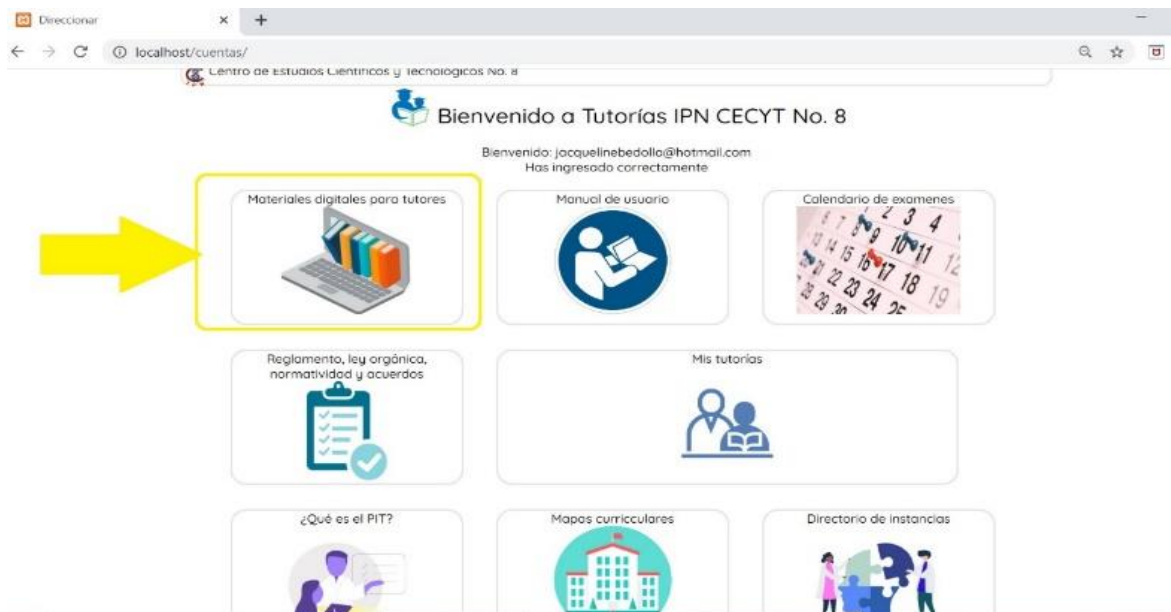
Figure 3. Digital materials for tutors