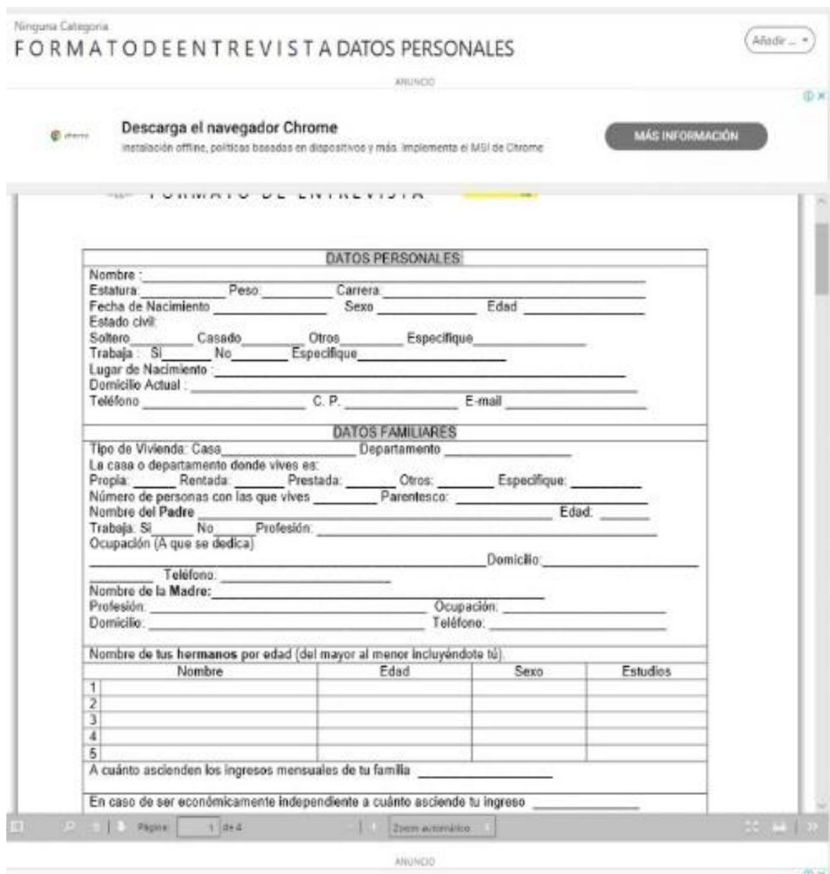
Figure 4. Initial diagnosis (tutored)