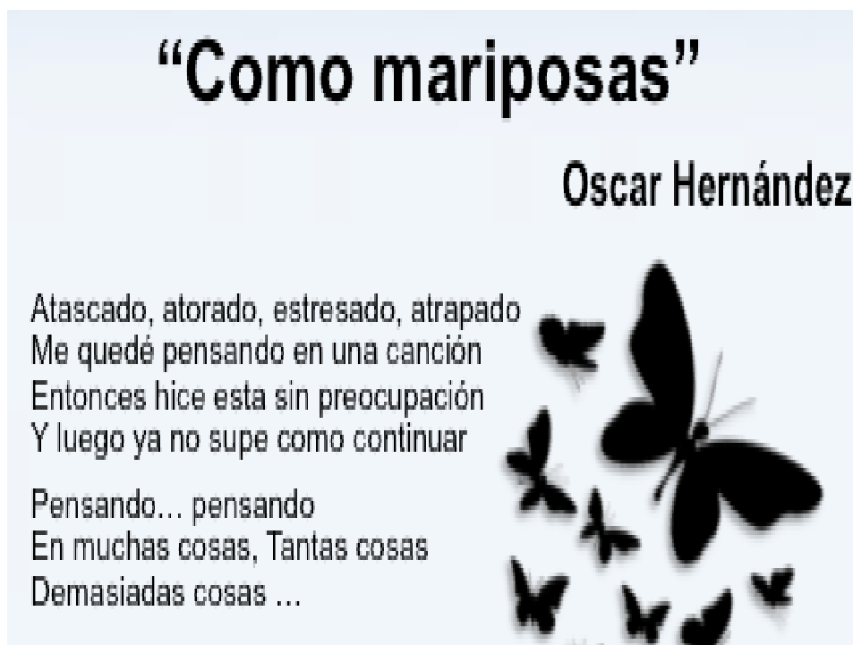
Figura 3. Estrofa de una canción elaborada por un estudiante del taller de arte y cultura