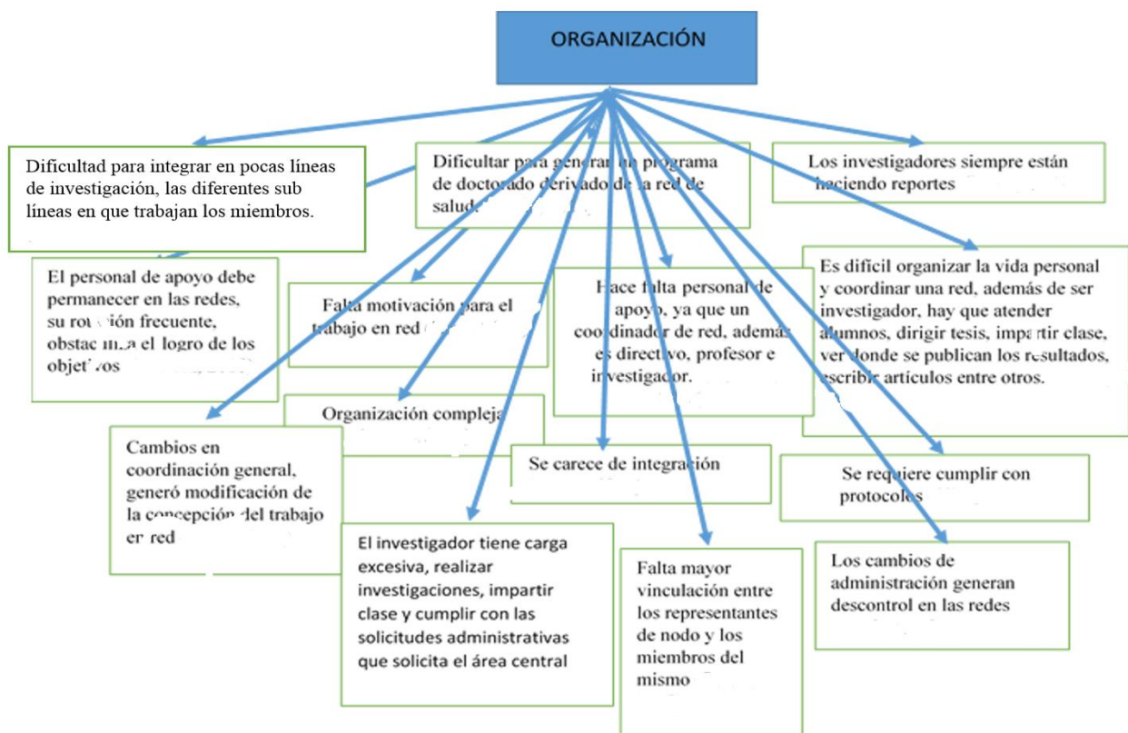
Figura 2. Retos de organización

Organizational problems faced by the coordinators also included the following: lack of motivation on the part of the members to work in a network; application of the elements of the organization process, this was reflected in the moment when, at the central level, there were changes of administration in the Coriyp, which affected the organization within the networks, for example, of the 120 members in the power grid, only 20 remained; greater integration is needed, especially in the energy network; the workload of the coordinators of a network must be carried out without support personnel, since, generally, in addition to being network coordinators, they are civil servants or teachers, or they perform all three functions at the same time. No doubt more liaison is required between the node representative and the members of that node.