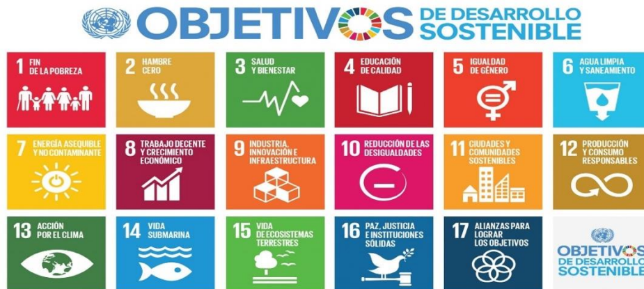
Figure 2. Goals of the 2030 Agenda

These elements respond to a competency-based approach that has been implemented in basic education in Mexico since 2004 and encourages students not only to be self-taught, but also to collaborate in teams to solve current problems that affect their communities. One of the most transcendental aspects of this pedagogical approach is that exams that promote memorization as the only form of accreditation have been left in the past and valuable tools such as case studies, problem-based learning, or challenges have been incorporated.