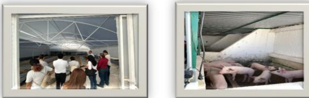
Figure 1. Photographs of the sowing and raising pigs

Nobody left their country with the intention of being in this shelter, they have aspirations, a project. Just these plans in migrants make it difficult to have permanent human resources to support the sustainable activities of the shelter.