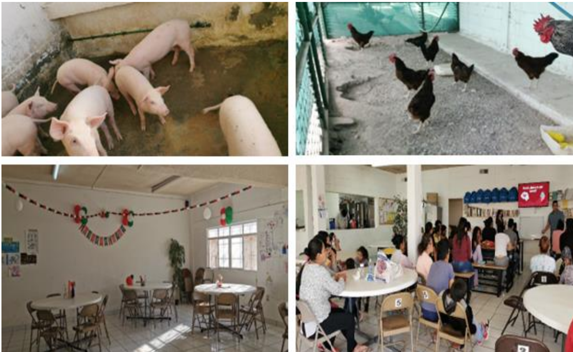
Figure 3. San Matías migrant shelter in Ciudad Juárez

The San Matías shelter offers a decent space for any migrant profile, according to the classification indicated by López (March 11, 2021), which includes children, women, families, the elderly, among others. The need for financial support from various actors in the public policy of attention to migrants is confirmed, such as agencies of the different levels of government, private companies, civil society and religious organizations, mentioned by the CNDH (2018), which confirms the advantage of having sustainable shelters that give the migrant the option to learn and carry out a trade that allows them an immediate income through collaboration in the productive activities of the shelter, since 49% migrate for economic and labor reasons.